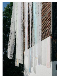
13a) Stephanie Baechler: Forget Me Not, 2024, installation at the Tröckneturm, St. Gallen